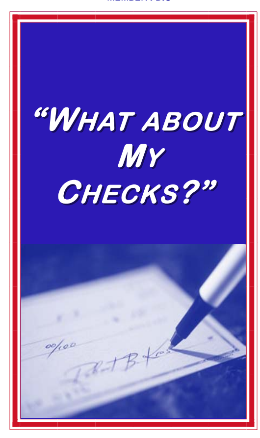
YOUR BANK INFORMATION HERE